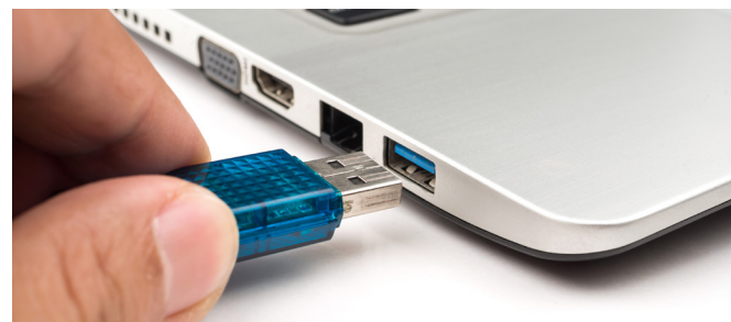
EXT-UMS-0001 USB Music Play

Connection option for external audio data carriers (e.g. smartphone, iPod)