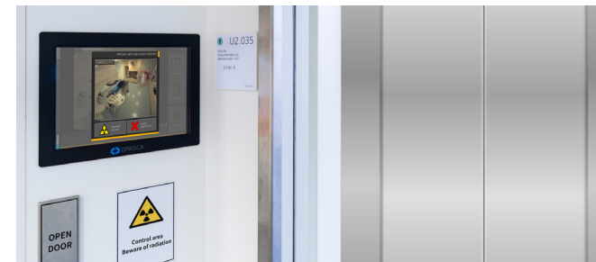
EXT-DOT-0001 Door Terminal

With Face to Face you enable the personal care of your patients even if they are physically separated. The audiovisual communication solution has a positive effect on cooperation, reduces stress and thus the need for anesthesia, and also enables accompanying persons to be involved.