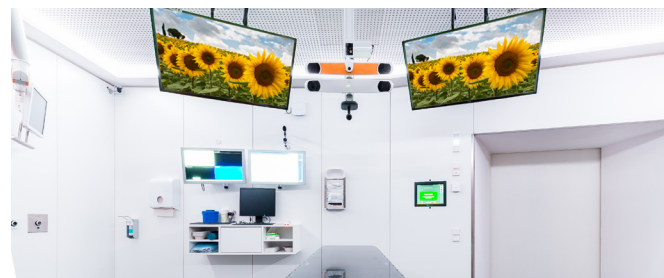
EXT-AMD-0001 Ambient Diashow

Connection option for USB sticks to play audio content stored on them