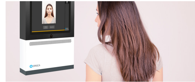
EXT-PAV-0001 Patient Validation

Reliable avoidance of misidentification: Reliable and automated patient validation based on biometric facial recognition.