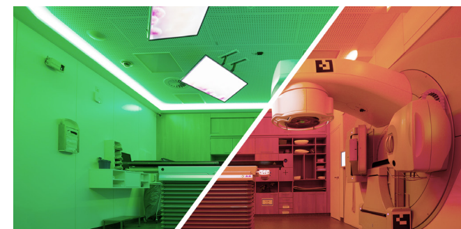
EXT-GAF-0001 Gating Feedback

Make sure that you also have access to safety-relevant information such as camera images or current radiation at the entrance to the treatment room.