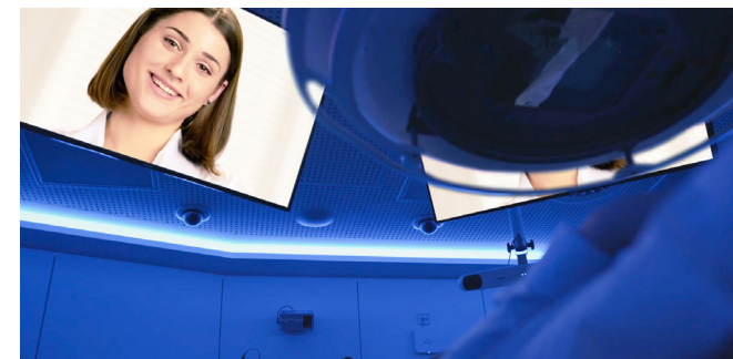
EXT-FTF-0001 Face to Face

Reliable avoidance of misidentification: Reliable and automated patient validation based on biometric facial recognition.